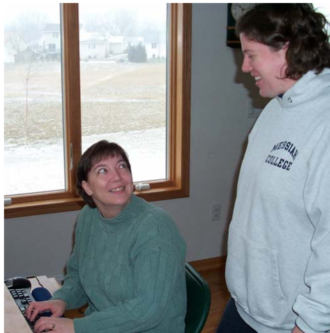
This was a staged picture for another newsletter, but it gives you an idea of what I look like working from home on my computer.