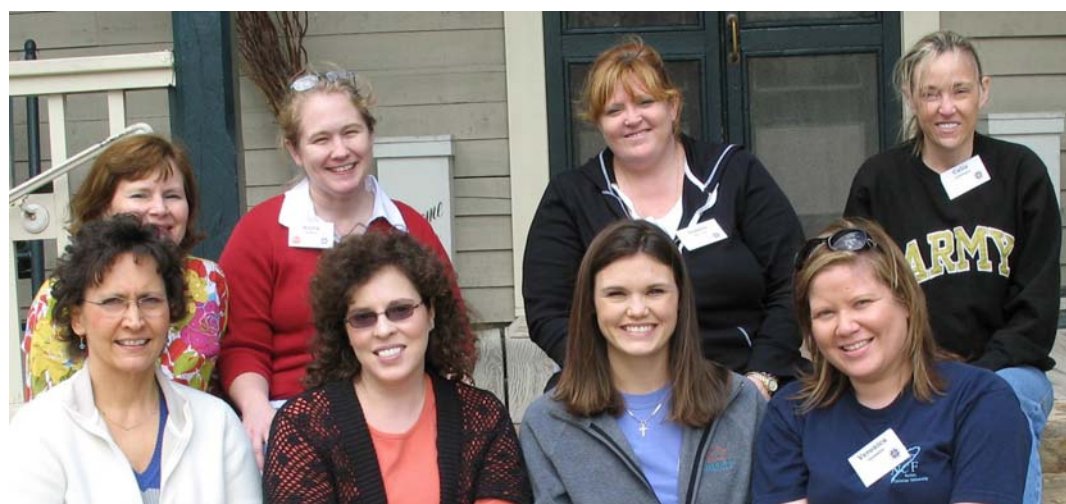
UTT NCF Reunion at Round Top

The answer then and now is...NONE! Our God is the ONLY god that desires to be intimate with his people and who LISTENS when His people pray to him. At the February Round Top Conference, Honoring Life & Offering Hope in Palliative Care , we focused on how our God is always ready to listen to us, especially when we are suffering, confused, and unsure of the future. Nurses learned new and innovative ways that they can care for patients who are experiencing life-limiting health challenges such as disability, pain, loneliness, fear, and how they can offer hope and point them to Jesus through prayer and sharing Scripture about the unchanging character of God.