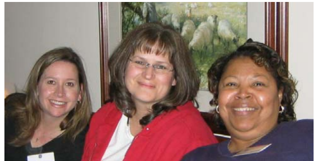
Round Top friends...