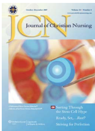
Oct/Dec 2007 JCN cover