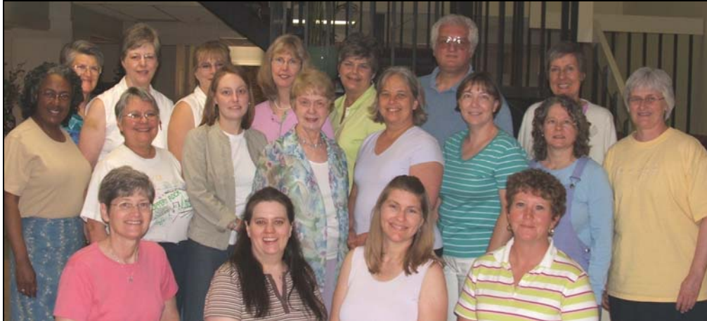
Some NCF staff at the meeting

The NCF Staff Meeting and National Planning Retreat June 6-11 was a highlight of the last months. God blessed the 30 staff and volunteer leaders who gathered in Chicago to wait on God and plan for the future.